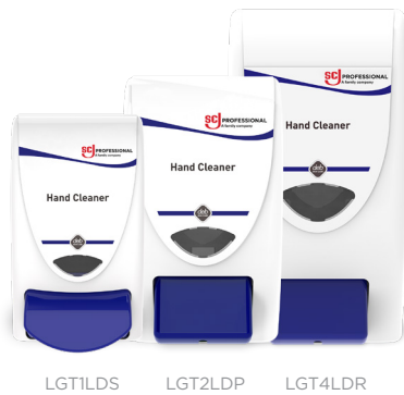
LGT1LDS LGT2LDP LGT4LDR