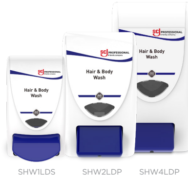
SHW1LDS SHW2LDP SHW4LDP