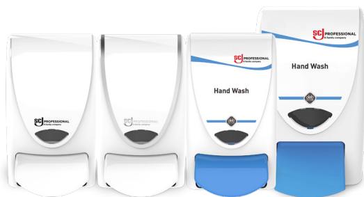
WHB1LDS DIS2127 WRM1LDS WRM2LDP